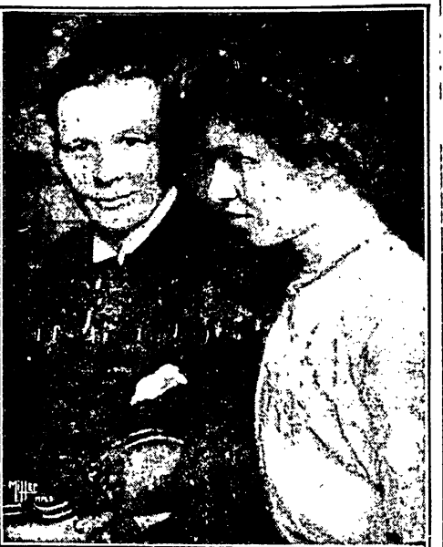
Violinist and Pianist.