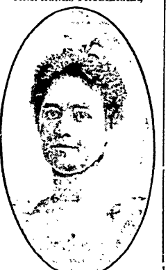
Leads Discussion on Public School Music.