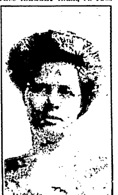
Member of Program Committee.